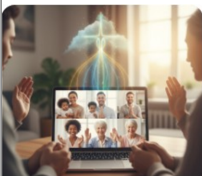
WORTH INTERCESSORY TEAM PRAYING TOGETHER FOR OUR PARISH

NEW Worth Intercessory Team (WIT): This 1 st of October, we'll be starting a new group of prayer warriors. We'll meet online via Microsoft Teams at 8pm on the first Wednesday of the month (45 min - 1hr), creating a welcoming space to pray together.